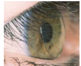
Central position is desirable